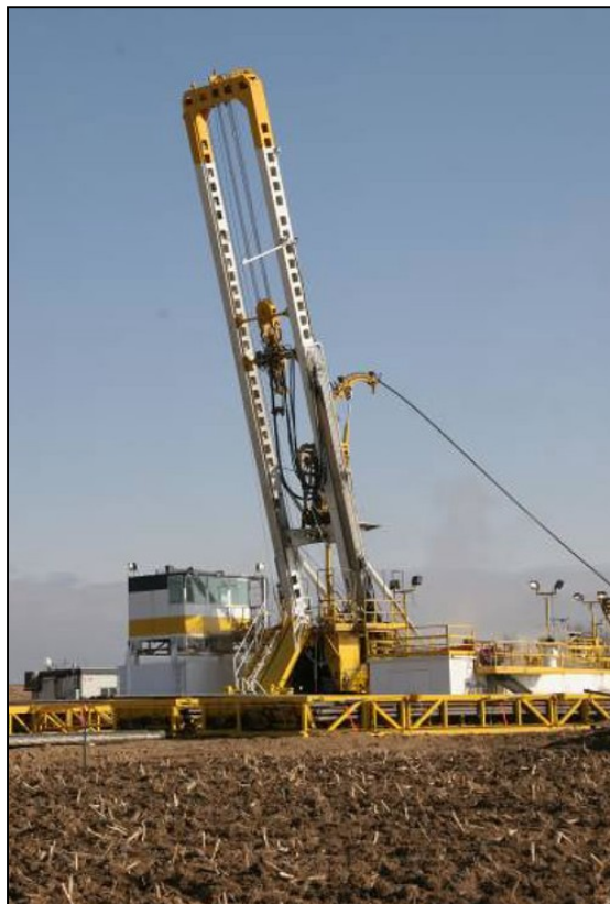
Photo of COTD™ drilling rig